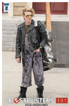
RETAILER INCENTIVE WRAPAROUND PHOTO COVER