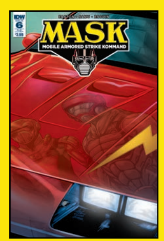
SUBSCRIPTION COVER Art by Abel Cicero Colors by Monica Kubina