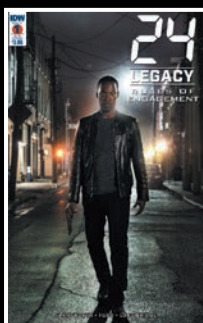
SUBSCRIPTION PHOTO COVER