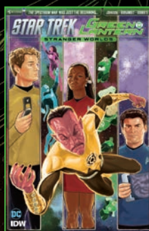
SUBSCRIPTION COVER art by Hugo Petrus