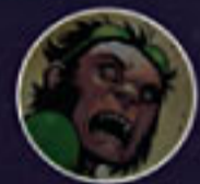
MOON BOY AGENT OF HYDRA