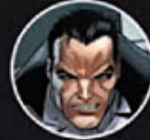
PUNISHER 2099 (JAKE GALLOWES)