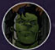
HULK (RICK JONES)