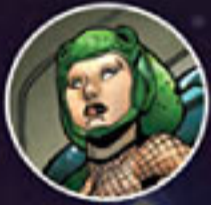
MADAME HYDRA (OPHELIA SARKISSIAN)