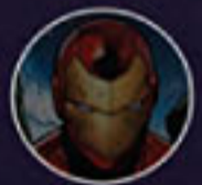
IRON MAN (TONY STARK)