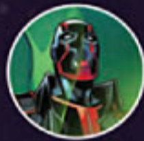
NIGHT THRASHER (DWAYNE TAYLOR)