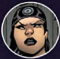
BULLSEYE (ELEKTRA NATCHIOS)