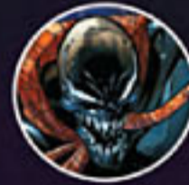
VENOM (EDDIE BROCK)