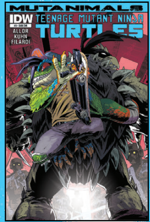
Subscription Cover Art by Ben Bates