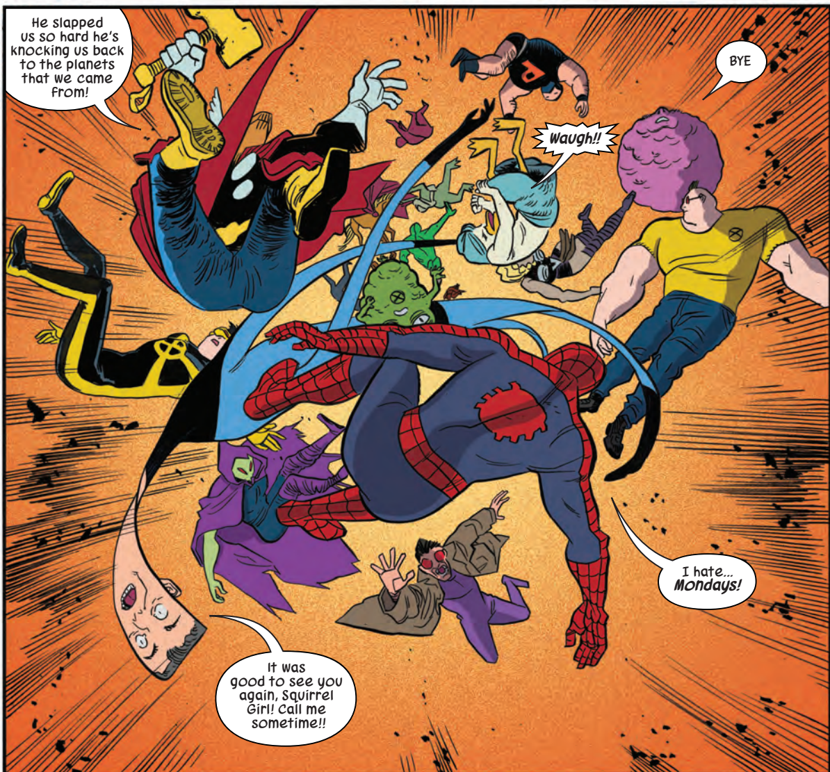
Here is a short but true Howard the Duck story: When Howard lands back on Earth in NYC, he finds it's actually nine days after he was first teleported away by Loki. The Silver Surfer literally knocked him into next week , and now all his bills are overdue! He's so mad , the end!