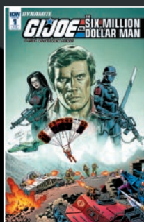
Retailer Incentive Cover Art by Jerry Ordway Colors by HiFi