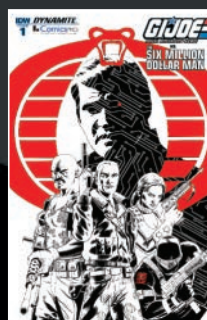
ComicsPro Cover Art by John Cassaday