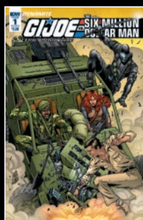
Cover B Art by SL Gallant Colors by James Brown