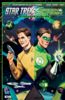
ARTIST'S EDITION COVER art by Sandra Lanz