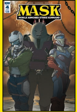
SUBSCRIPTION COVER Art by Joe Suiitor