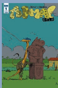
Cover A by Izar Lunacek