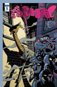
RI Cover by Troy Little