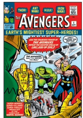
FIRST APPEARANCE: AVENGERS #1 (1963)

THE ORIGINAL AVENGERS WERE INITIALLY gathered when Asgardian trickster Loki tried to manipulate a battle between his hated adoptive brother Thor Odinson and the Hulk (Bruce Banner). Iron Man (Tony Stark), the Wasp (Janet Van Dyne), and Ant-Man (Hank Pym) were also drawn into the conflict, but quickly joined forces to defeat Loki, then stayed together as the Avengers. Soon after forming, the team discovered World War II hero Captain America (Steve Rogers) in suspended animation and recruited him as a retroactive founding member and team leader. Over the years, the team has welcomed over 200 superhumans in their ranks. Through victories and tragedies, deaths and triumphs, the Avengers remained the Earth's mightiest heroes and protectors, assembling whenever humankind was in danger.