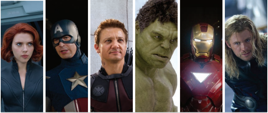
BLACK WIDOW, CAPTAIN AMERICA, HAWKEYE, HULK, IRON MAN, THOR Active: Marvel's The Avengers (2012)

ordered a nuclear strike against Manhattan, despite Fury's protests, and the Hulk gave Loki a severe beating, leaving the Asgardian incapacitated. Dr. Selvig revealed to Widow that he had programmed a safeguard into the equipment: Loki's scepter could destroy the machinery. When Fury warned Iron Man that the nuclear missile was en route, Iron Man steered it through the portal and redirected it into the massive Chitauri mothership in deep space, destroying it and deactivating the Chitauri forces on Earth. Widow destroyed Selvig's equipment, closing the portal just as Iron Man returned through it.