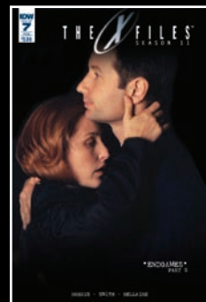
SUBSCRIPTION COVER Photo Cover