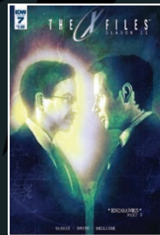
REGULAR COVER Art by Menton 3