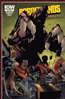
REGULAR COVER ART BY AGUSTIN PADILLA COLORS BY ESTHER SANZ