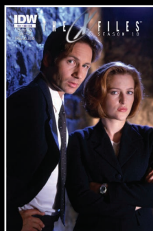
SUBSCRIPTION COVER Photo Cover