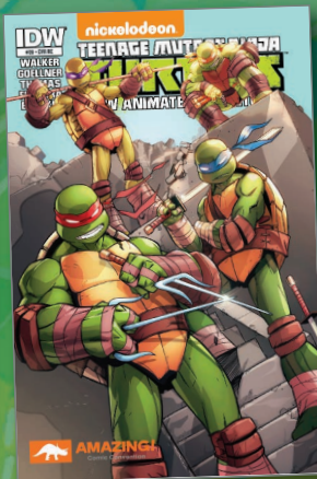
Amazing Con Exclusive Art by Eddie Nunez