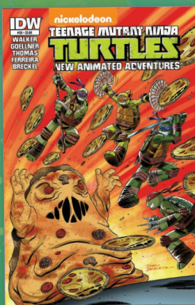
Regular Cover Art by Dario Brizuella