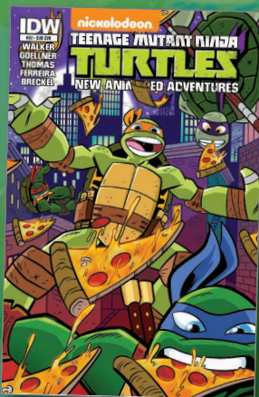
Subscription Cover Art by Derek Charm