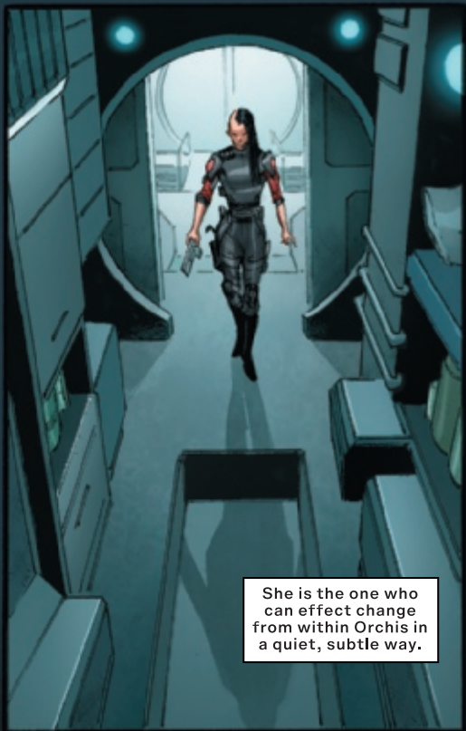
She is the one who can effect change from within Orchis in a quiet, subtle way.