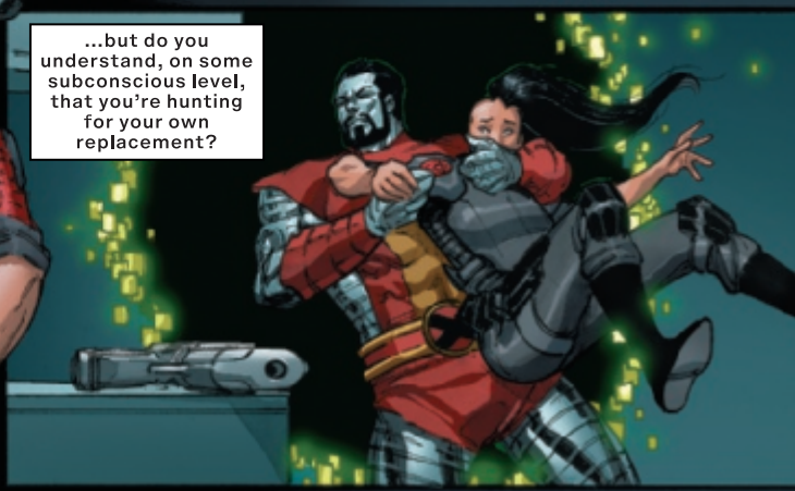
Do you feel relief that your story will soon end...