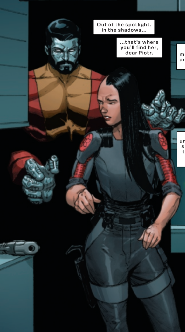
Out of the spotlight, in the shadows...