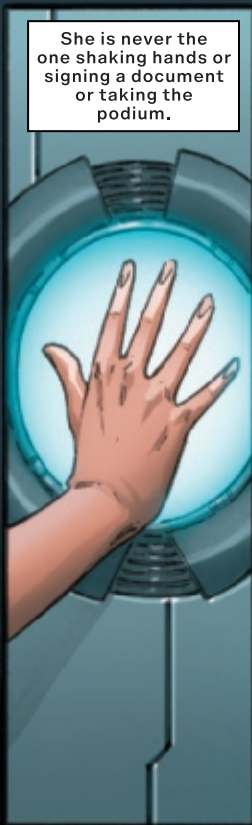
She is never the one shaking hands or signing a document or taking the podium.