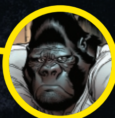
GORILLA-MAN MAN AND GORILLA, YOU GET THE IDEA