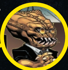
BROO MUTANT OF THE ALIEN BROOD RACE