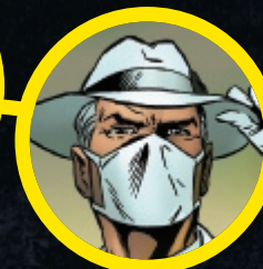
JAMES BRADLY A.K.A. DOCTOR NEMESIS