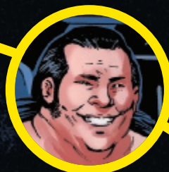
FAT COBRA IMMORTAL WEAPON POWERED BY CHI AND KUNG FU