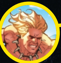
KEVIN PLUNDER A.K.A. KA-ZAR