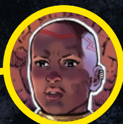
OKOYE DIRECTOR OF THE A.O.W. AND LEADER OF THE DORA MILAJE