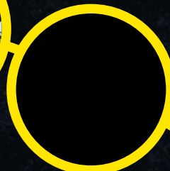
TBD RECRUIT AS NEEDED