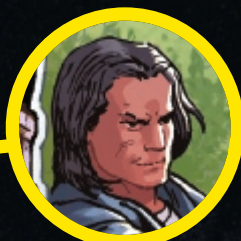
JASON STRONGBOW A.K.A. AMERICAN EAGLE