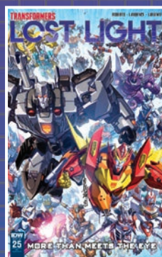
RETAILER INCENTIVE COVER