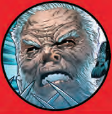
OLD MAN LOGAN