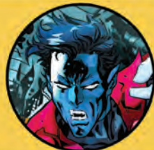
NIGHTCRAWLER KURT WAGNER