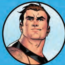
BEAST HANK McCOY