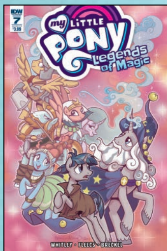
SUBSCRIPTION COVER art by Brenda Hickey