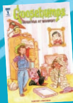
COVER RI ART BY CAT FARRIS