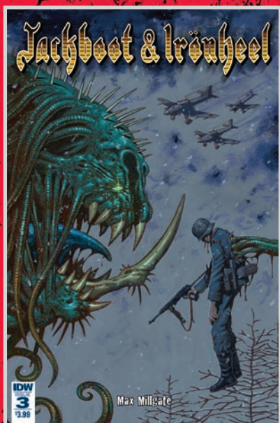
Standard Cover Art by Max Millgate

Punishment: the much harsher conditions of Solitary Cell No. 9!