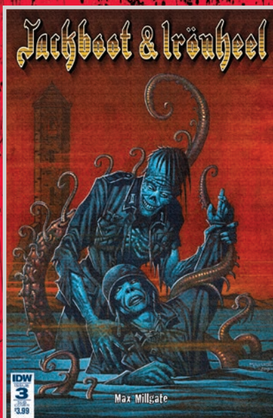
Subscription Cover Art by Max Millgate

For international rights, contact licensing@idwpublishing.com