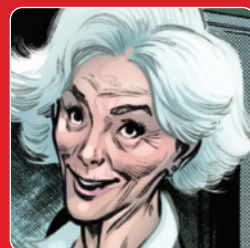
AUNT MAY PARKER