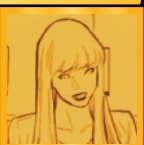
MARY JANE WATSON