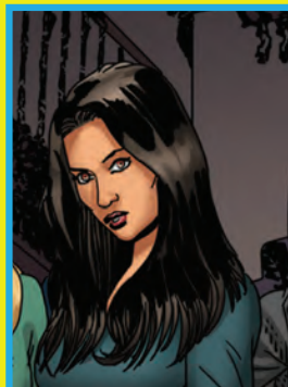
MIRAGE DANIELLE MOONSTAR