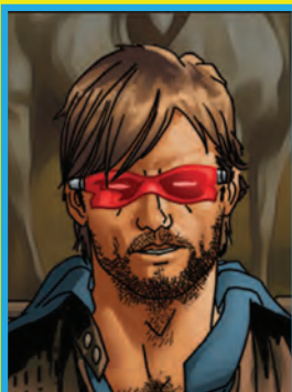
CYCLOPS SCOTT SUMMERS