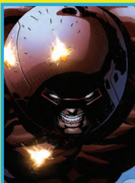
JUGGERNAUT CAIN MARKO