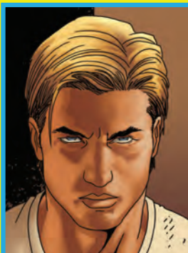
HAVOK ALEX SUMMERS