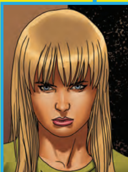
MAGIK ILLYANA RASPUTIN