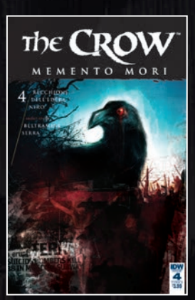
Cover B Art by <u>Davide Furnò</u>