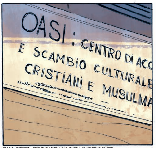
OASIS: CHRISTIAN-MUSLIM CULTURAL EXCHANGE AND WELCOME CENTER.