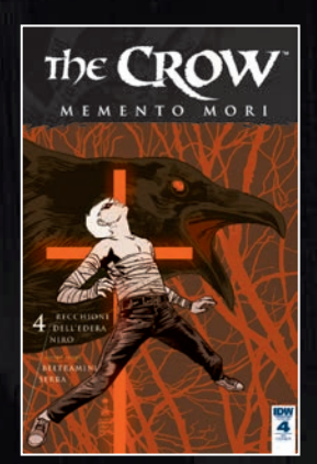
Retailer Incentive Cover Art by Francesco Francavilla

For international rights, contact licensing@idwpublishing.com