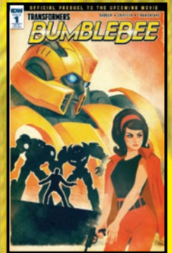
RETAILER INCENTIVE COVER B