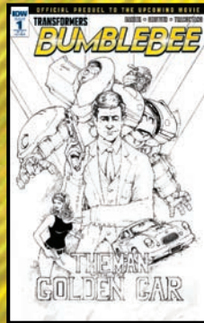
RETAILER INCENTIVE COVER A