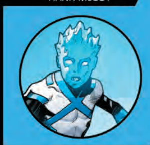
ICEMAN BOBBY DRAKE