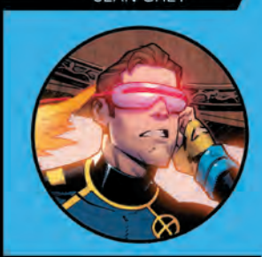
CYCLOPS SCOTT SUMMERS