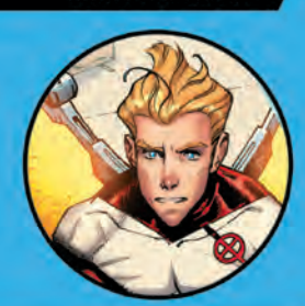
ANGEL WARREN WORTHINGTON III