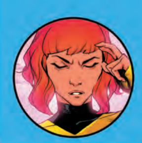
MARVEL GIRL JEAN GREY