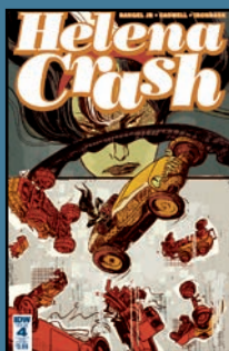
SUBSCRIPTION COVER art by Toby Cypress

For international rights, contact licensing@idwpublishing.com