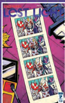
SUBSCRIPTION COVER A