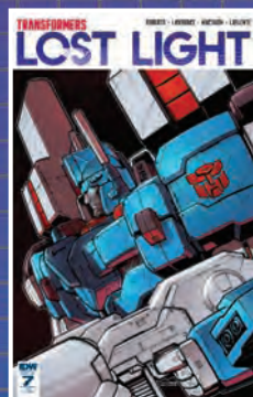
RETAILER INCENTIVE COVER