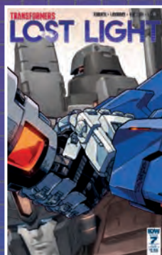
SUBSCRIPTION COVER B