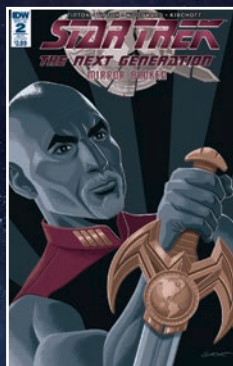
SUBSCRIPTION COVER Art by George Caltsoudas