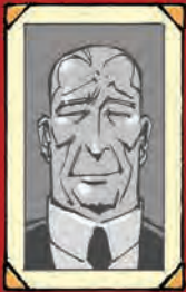
• UPTON •