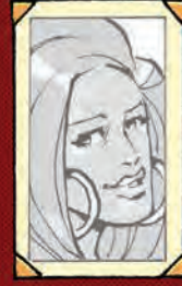
• SEN. WHITE •