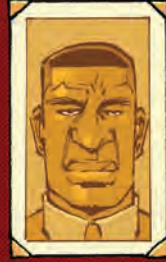
• COL. MUSTARD •