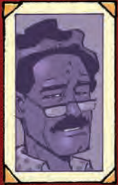
• PROFESSOR PLUM •