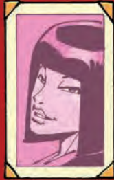
• DR. ORCHID •