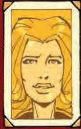
• DET. AMARILLO •