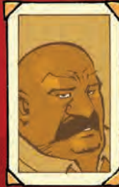
• DET. OCHRE •