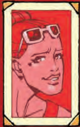
• MISS SCARLETT •