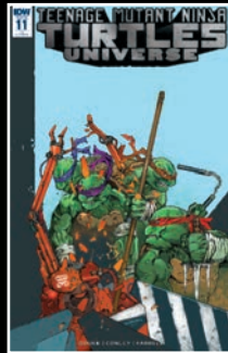
INCENTIVE COVER ART BY YACINE ELGHORRI