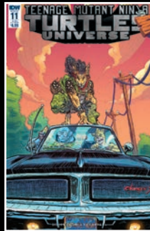
SUBSCRIPTION COVER ART BY AARON CONLEY COLORS BY JEAN-FRANCOIS BEAULIEU