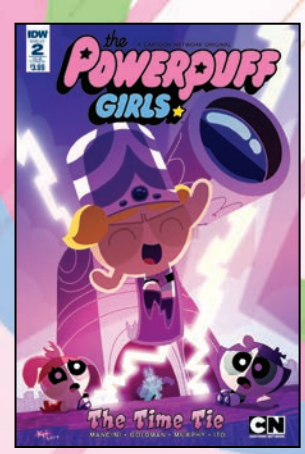
SUBSCRIPTION COVER art by Kyle Neswald