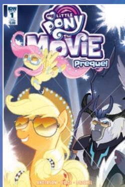
SUBSCRIPTION COVER art by Tony Fleecs