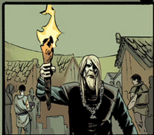
Oppressor of Norssk.