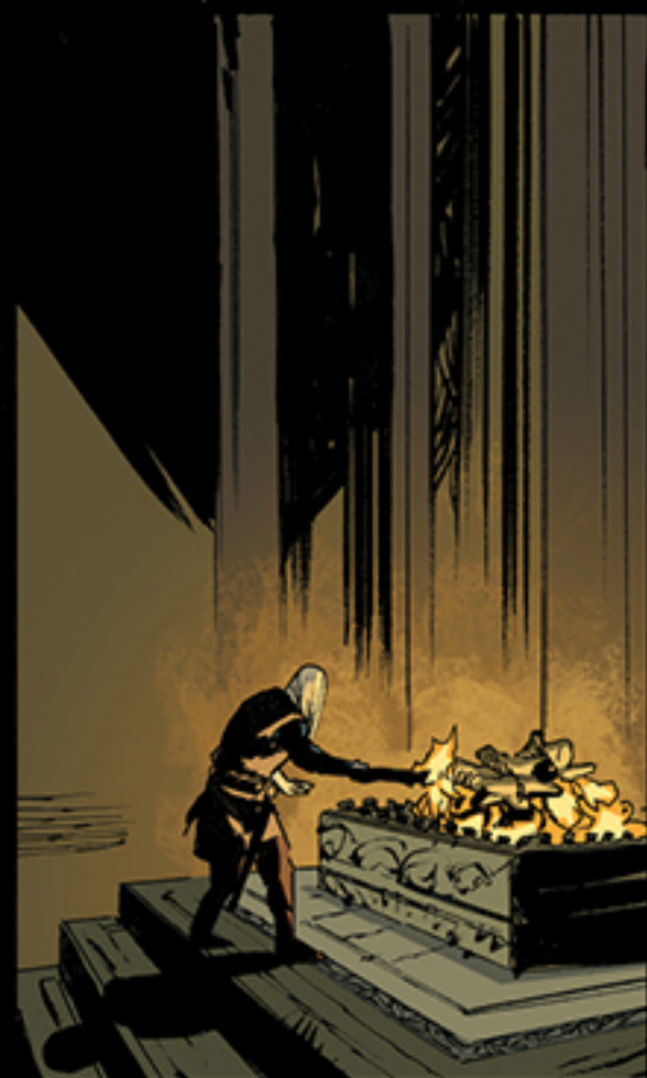
A new Holy Sec.