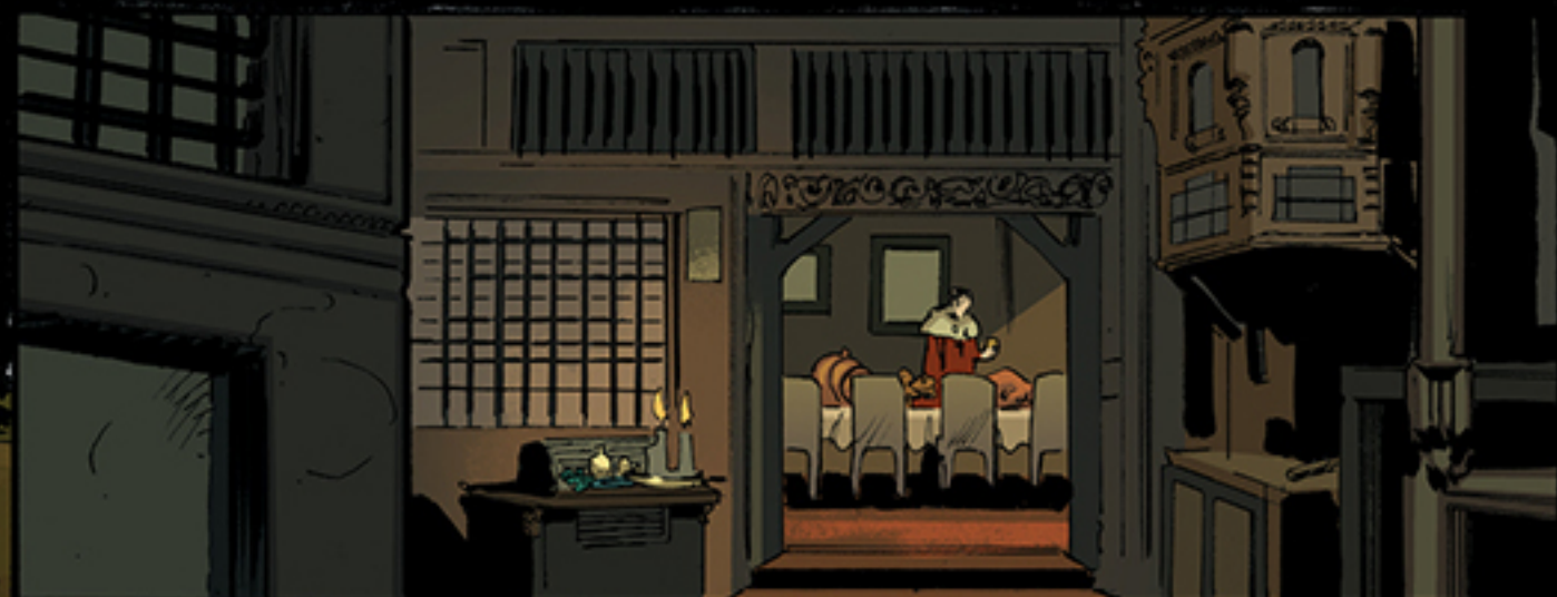
Bishop Oakenfort of Rome.