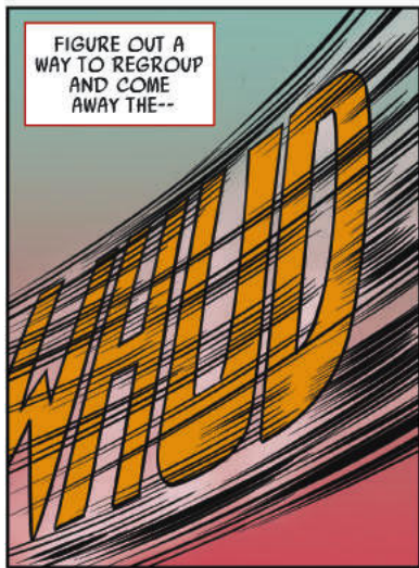
FIGURE OUT A WAY TO REGROUP AND COME AWAY THE--