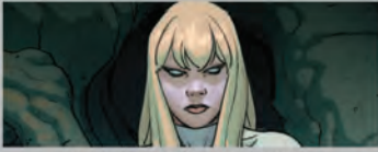
SUSAN STORM, ROYAL CONSORT