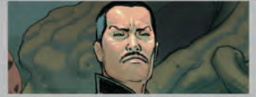
STEPHEN STRANGE, SHERIFF OF AGAMOTTO