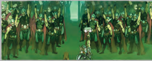
ENFORCERS OF DOOM'S JUSTICE