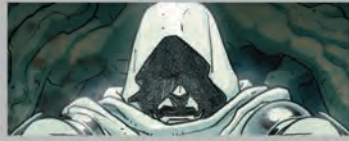
GOD EMPEROR DOOM, RULER OF BATTLEWORLD