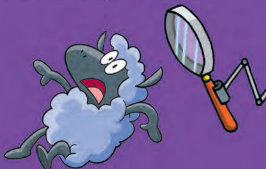
*Special Undercover Investigation Team

Join the Agents of S.U.I.T. on their biggest case yet—coming February 2025!