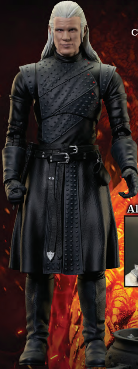
Royal Daemon Targaryen