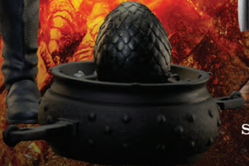
Ser Harrold Westerling