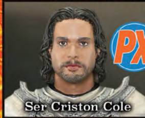
Ser Criston Cole