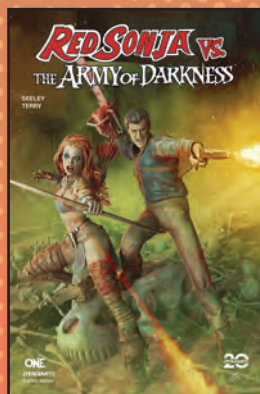
RED SONJA ® & © and related logos, characters, stories, names and distinctive likenesses thereof are owned by Red Sonja, LLC. All Rights Reserved. ARMY OF DARKNESS TM & ©1993 Orion Pictures Corporation. © 2025 Metro-Goldwyn-Mayer Studios Inc. All Rights Reserved. METRO-GOLDWYN-MAYER is a trademark of Metro-Goldwyn-Mayer Lion Corp. © 2025 Metro-Goldwyn-Mayer Studios Inc. All Rights Reserved.