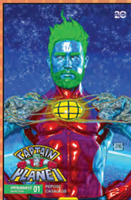
CAPTAIN PLANET AND THE PLANETEERS and all related characters and elements © & ™ Turner Entertainment Co. ($25)